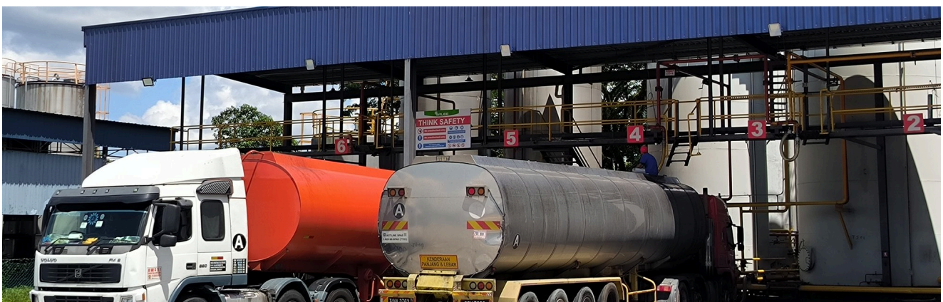
LOADING BAY · TANKER TRUCKS AT THE MILL

Overseas refineries, global commodity traders, regional processors, industrial buyers.