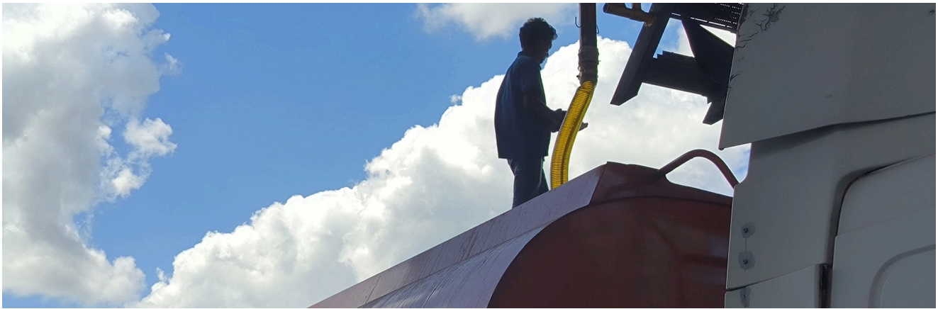
CPO LOADING · BULK TANKER AT THE MILL

Sourced from MPOB-licensed mills throughout Malaysia. Supplied locally to refineries or shipped as bulk cargo to international buyers. Specifications agreed before loading.